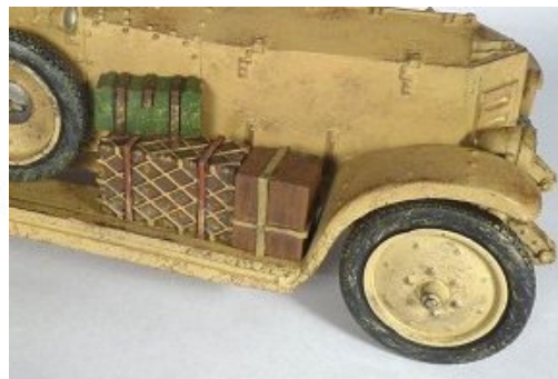
Camouflage Jerry Cans