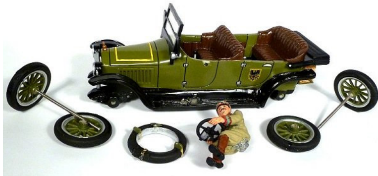
Staff Car in Pieces